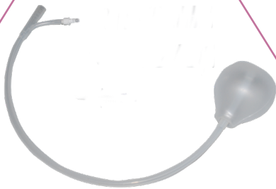
Dual Lumen Catheter and Pear Shaped Balloon

The MedGyn Postpartum Balloon Catheter is a disposable, multiple lumen catheter attached to an inflatable balloon system. It is designed to provide tamponade to control hemorrhaging from the uterus and vagina.