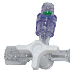
Three Way Stopcock